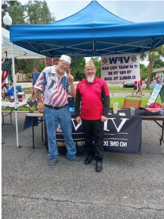
Veterans helping Veterans